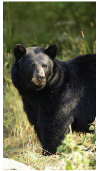
Black bears prefer bird feeds and suet because of their high fat content and easy accessibility. When bears discover a bird feeder filled with a calorie-rich meal, they won't soon forget and could become repeat visitors.

Additional tips and information on how to handle conflicts with wildlife are available at Michigan.gov/Wildlife .